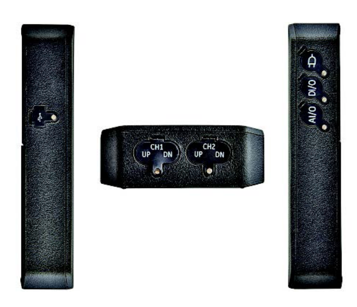
Transmitter electrical connections