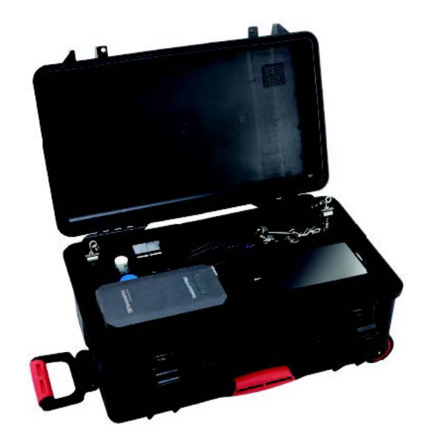
Optional hard shell carrying case