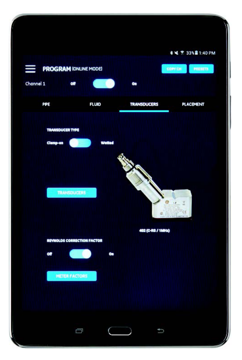
PT900 APP tablet display

Bluetooth® or wired (wired for Android only)