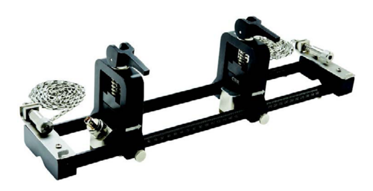
Clamp-on fixture with CRR transducers