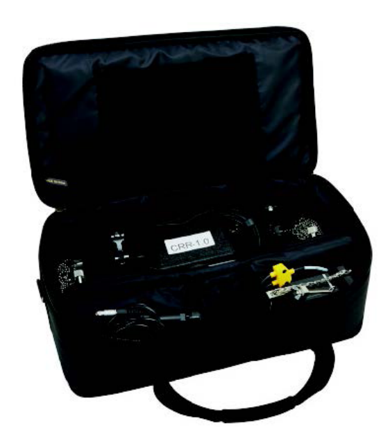
Standard soft shell carrying case